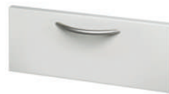
S. Satin Nickel Loop Pull (Add "B" suffix for black pull)