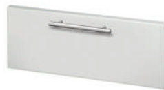
Q. Satin Nickel Bar Pull