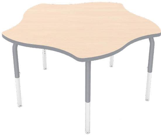
Surface Color: Kensington Maple

The tables are available in two main construction options, each offering different edge and laminate features. This blend of functionality, durability, and customization makes the Method Series Collaborative Tables ideal for dynamic educational environments. Method Tables are BIFMA and MAS Certified Green and include a limited lifetime warranty.