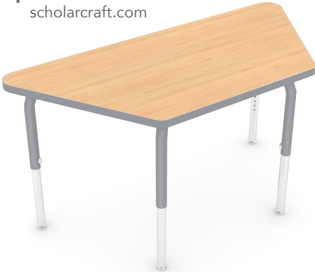
Surface Color: Kensington Maple